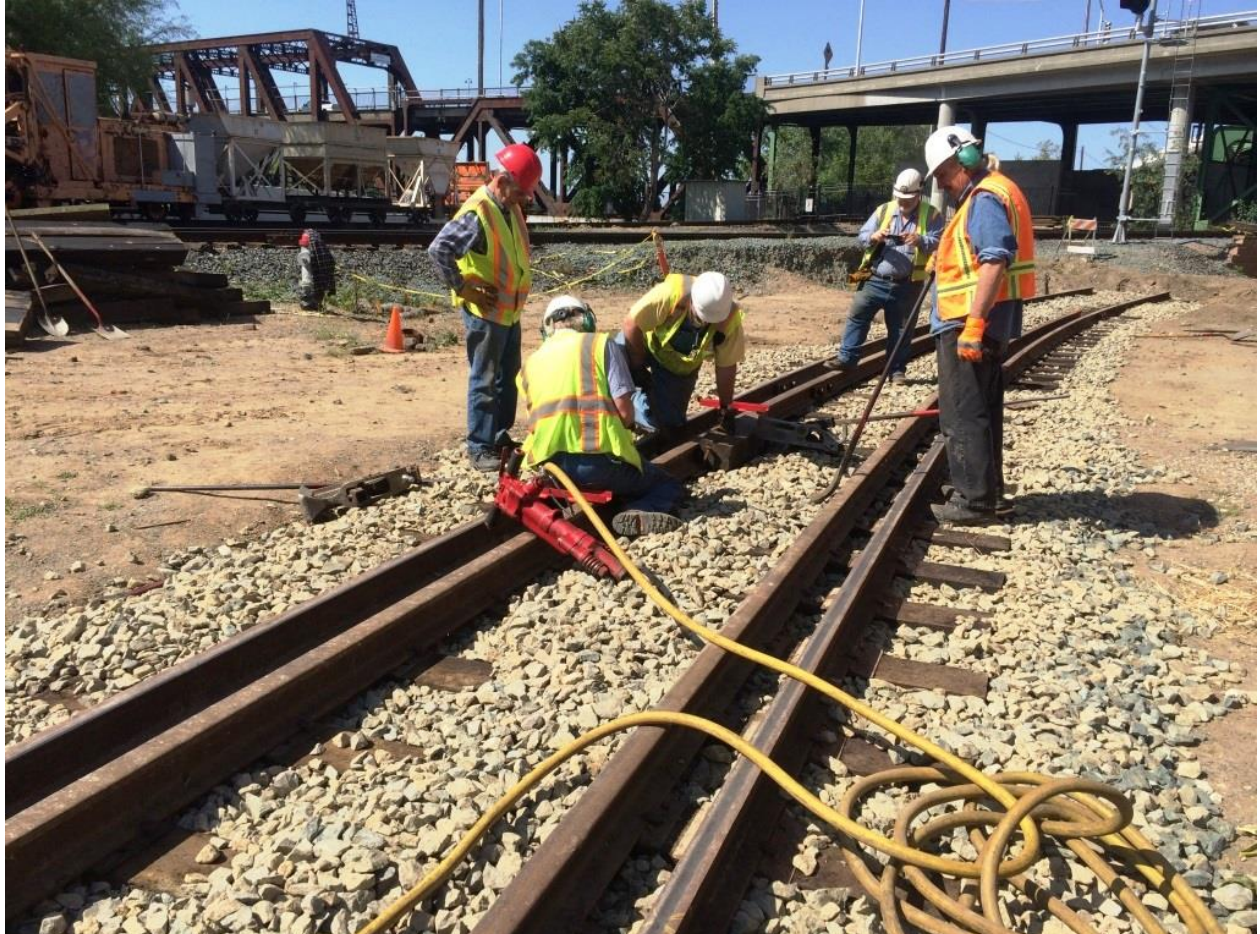
The process is repeated for the west rail, as well