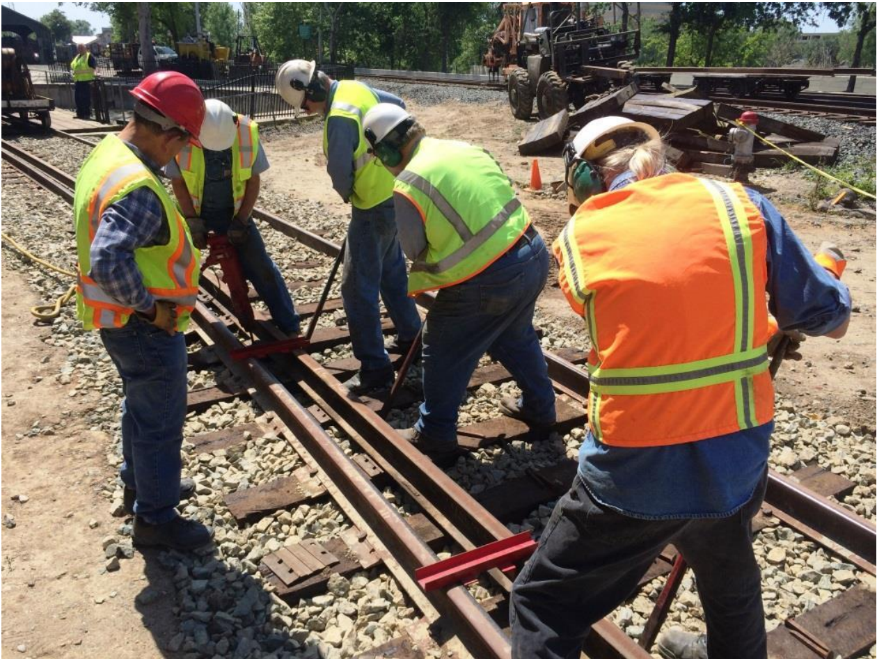
The MOW Team's interpretation of "Gandy Dancing..."