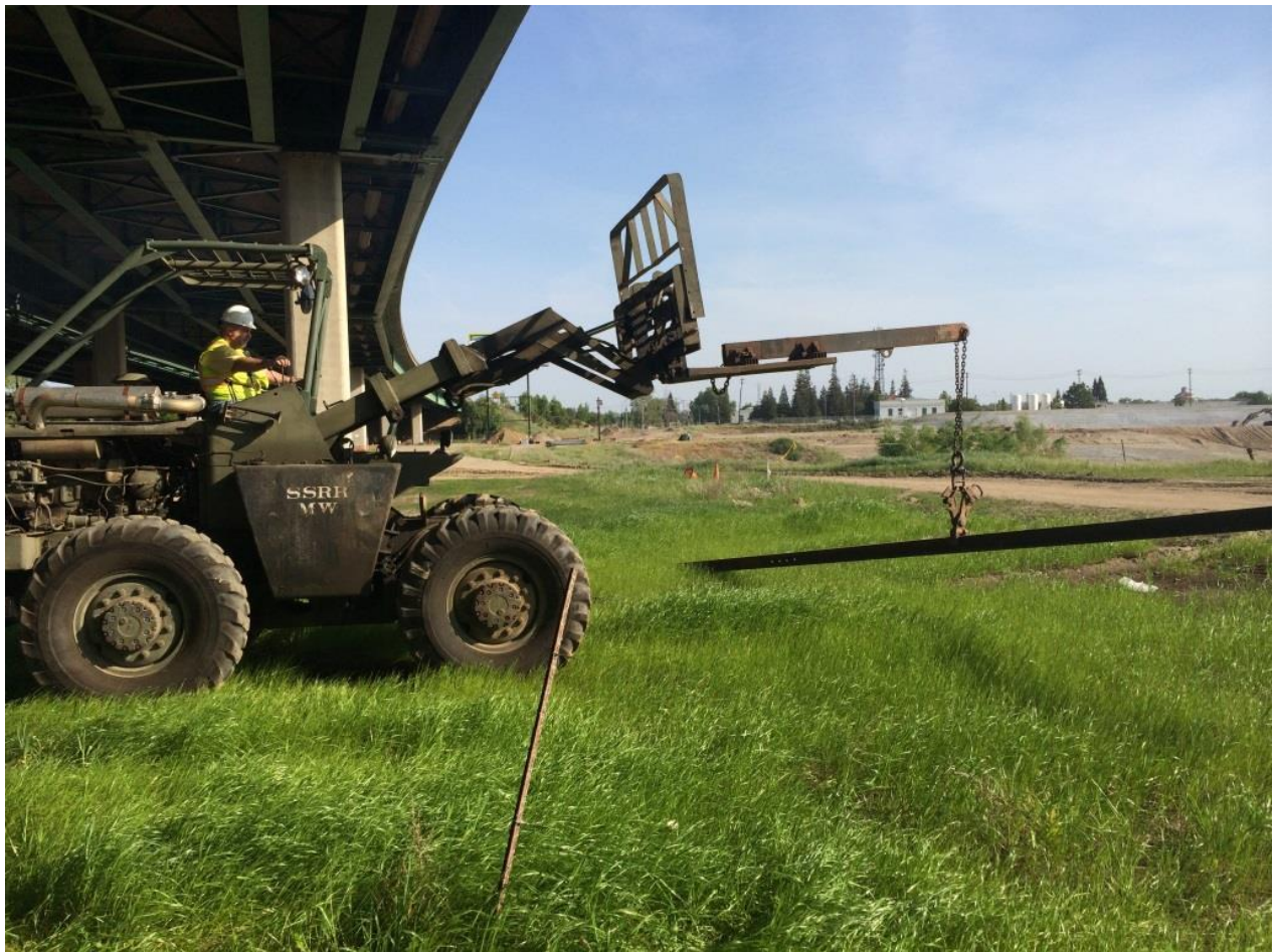
Big Green going green...