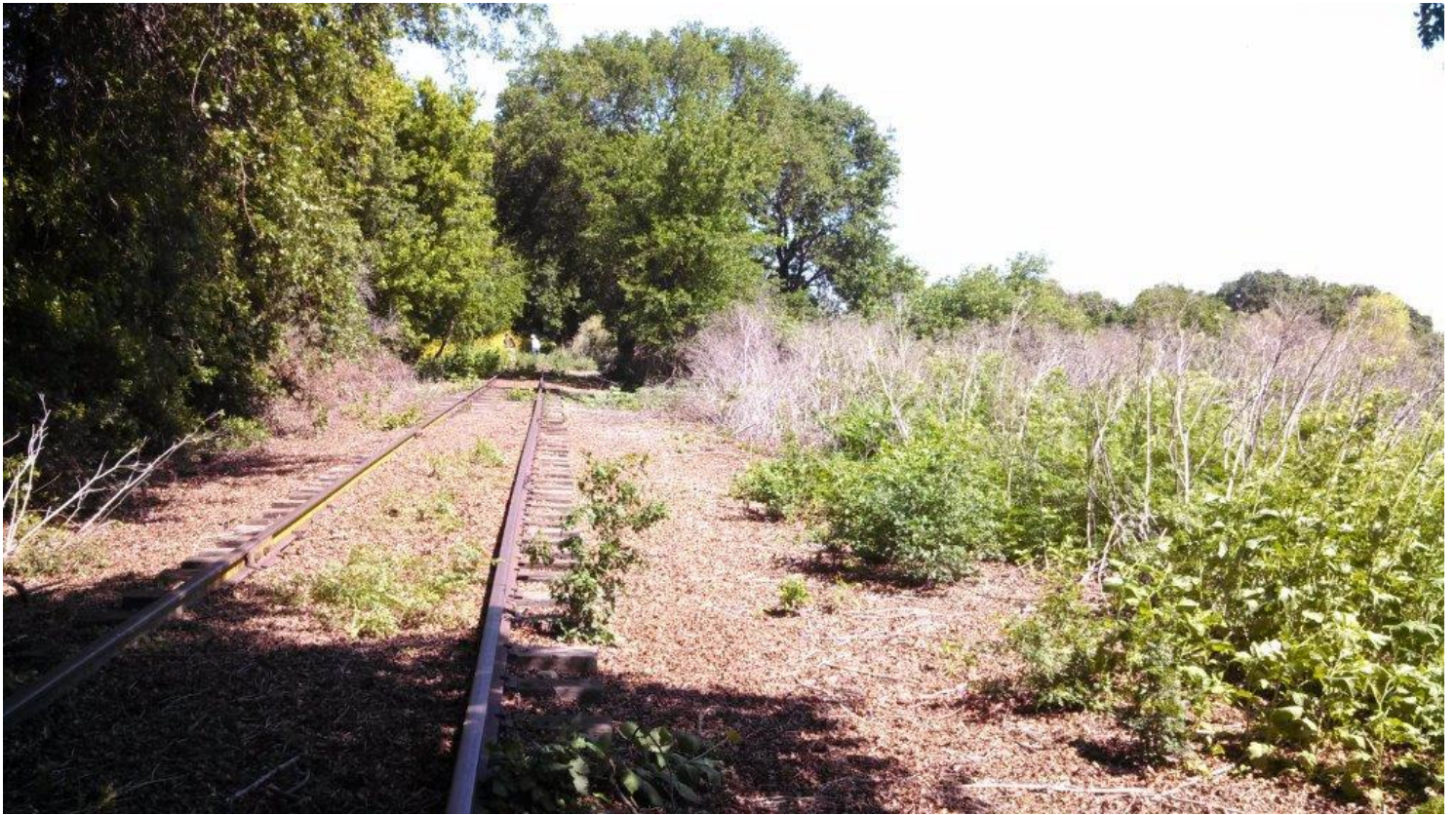
Mike T. at Hood "beating around the bushes..."