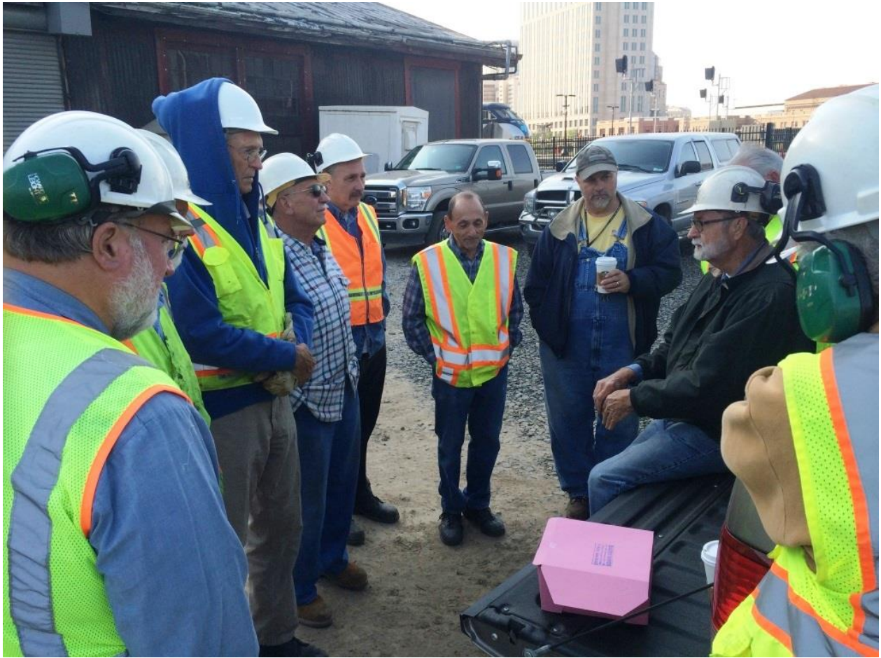
Let us bow our heads...